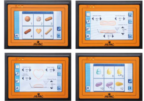
The Touch Screen Control Panel is intuitive, functional & very easy to use.

NOTE: Specifications are subject to revision and confirmation.